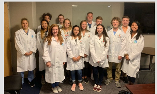
2019 Summer Interns